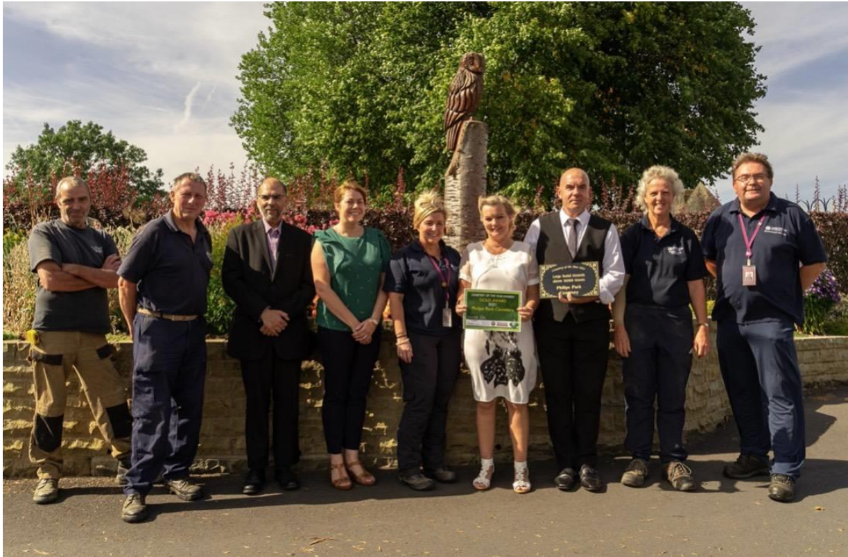
Philips Park Cemetery Large Burial Ground Winners 2021

The Cemetery of the year Award 2022 has been supported and endorsed by –